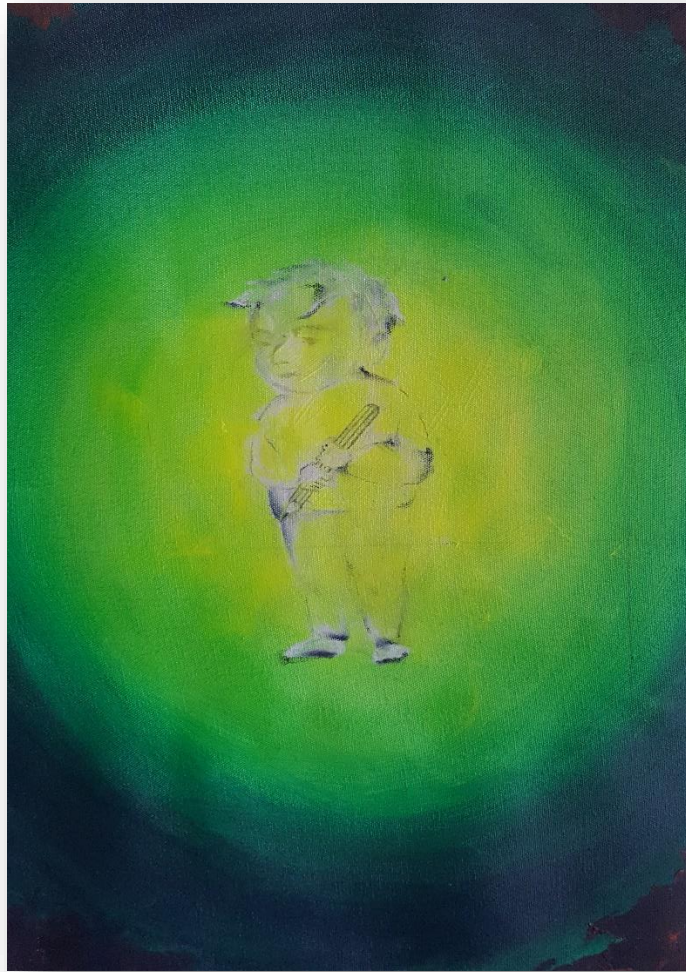
PAINTING BY: SU JIN